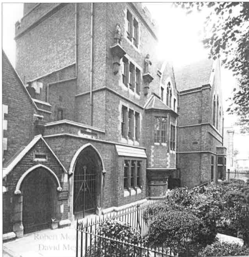
Any different today? St Mary Abbots School, June, 1924.