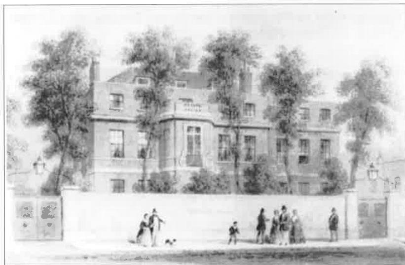
Gore House