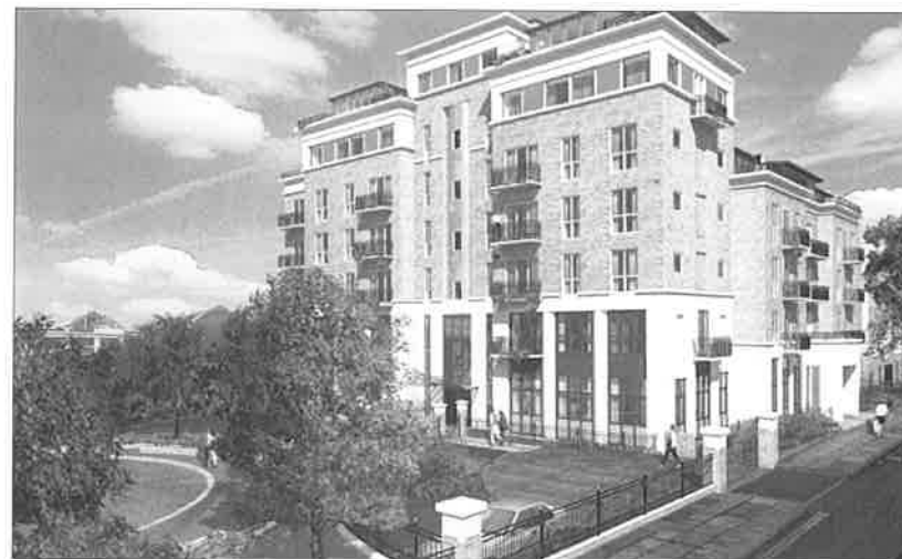
Best new building. 388 Kensington High Street/Russell Road, W14.

Winner of the award for the best new building was a residential property at the corner of Kensington High Street and Russell Road , close to Olympia. This is an important corner site at one of the entry points to the Borough, and the building, with its associated