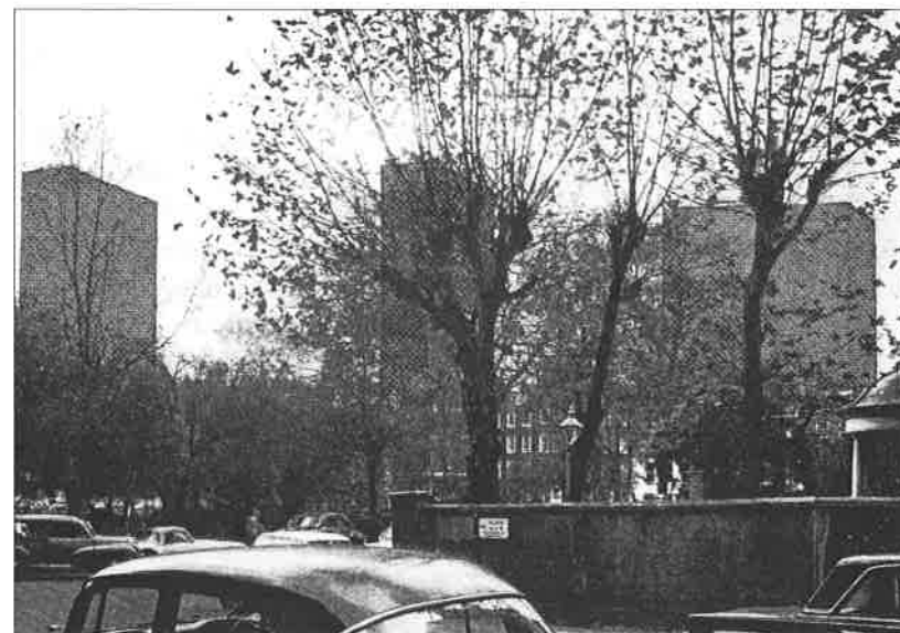
The tower blocks which would have dominated central Kensington if 1963 plans had been allowed. The view is from the north east corner of Kensington Square.

But it was a plan in 1963 for the development of the site to