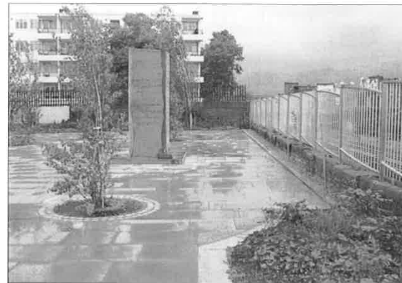
Canal Way, W10: Memorial to Ladbroke Grove train crash.

A special award was given to the memorial garden to the victims of the Ladbroke Grove train disaster . This has turned a left-over piece of land off Canal Way into a suitable place for contemplation overlooking the railway, with paving, planting and a memorial obelisk on which are carved the names of those who died. Architects: The Project Centre Ltd.