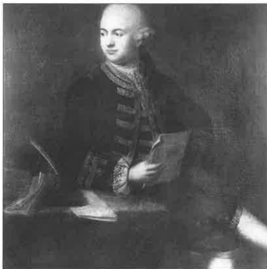
Daniel Sutton; portrait attributed to Sir Joshua Reynolds.

art seems to be carried out to very great perfection.'