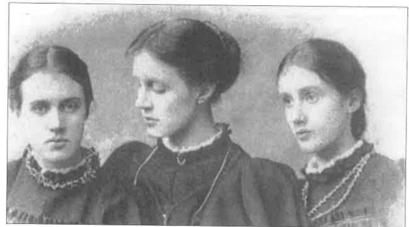
The Three Sisters. From right to left, The future Virginia Woolf, her half-sister Stella Duckworth and the future Vanessa Bell. Circa 1896

From this little-known society comes a short book reflecting everyday life in Kensington during the last decade of the 19th century—everyday life, that is, among the very-well-to-do. It was the time when the future Virginia Woolf and her sister, Vanessa, were still breathing the rarified air of Kensington as members of the Stephen family at 22 Hyde Park Gate. Before long they would transfer themselves to Bloomsbury, there to pour scorn on Kensington and all that it represented.